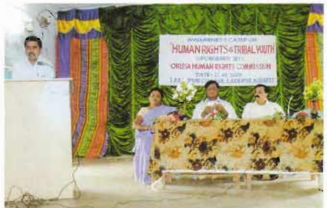
Awareness Camp on 'Human Rights and Tribal youth' sponsored by OHRC & organised by Laxmipur College, Koraput