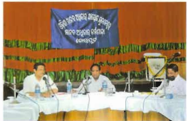
Workshop on Human Rights organised by Orissa Human Rights Commission at Koraput on 28.01.2009 & 29.01.2009