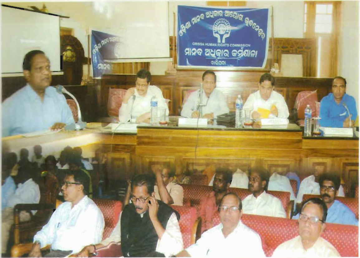
Workshop on Human Rights on 'Women Trafficking & Child Labour' organised by Odisha Human Rights Commission at Baripada on 25.02.09 & 26.02.09