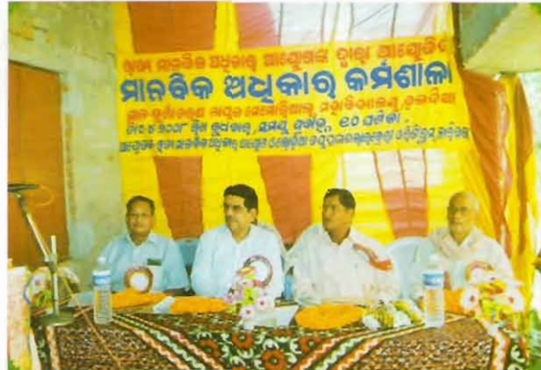
Workshop organised by Lohia Jayprakash Library & Reading Room, Cuttack