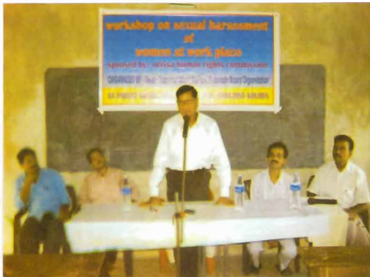
Workshop on 'Sexual Harassment of women at work place' sponsored by OHRC & organised by 'Seven Diamond World Welfare El-Dorado Board, Dangarpada, Khorda