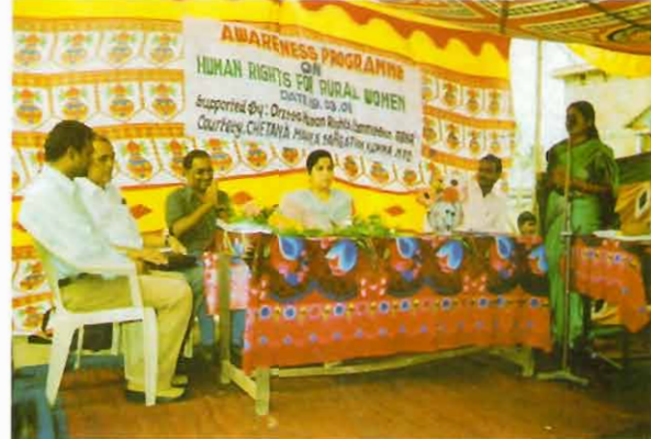
Awareness programme on Human Rights for 'Rural Women' sponsored by OHRC & organised by Chetana Mahila Sangathan, Nuapada